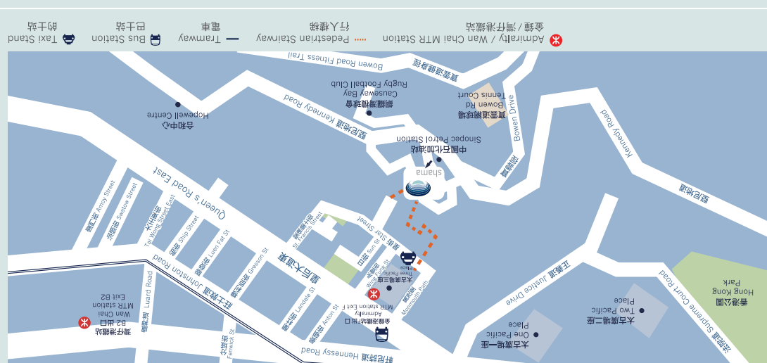
Location Map 位置圖

Provides 24 lavishly designed one-per-floor serviced apartments, where complemented by fabulous views of the Central, Admiralty, and Wan Chai districts. With convenient access to the Admiralty MTR station through a five-minute walk to Three Pacific Place. 擁有24套一梯一戶的服務式公寓，憑藉遠眺中環、金鐘及灣仔的絕人景緻。只需步行五分鐘，便可透過太古廣場三期前往金鐘港鐵站，便捷生活，盡在掌握。