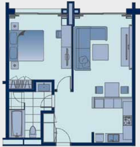
1 bedroom premier (66sqm)